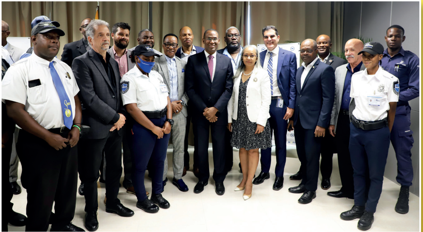
Hon. Nigel Clarke (centre), DPhil., MP, Minister of Finance and the Public Service shares a moment with the members of the security fraternity following his policy address on Thursday, January 19, 2023.

The government is moving to change the status of security guards from independent contract workers to regular employees for guards providing services within the public sector.