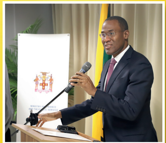
Hon. Nigel Clarke, DPhil., MP, Minister of Finance and the Public Service delivers the Policy.

The task force is expected to negotiate with scores of security guard firms who are counterparties to these contracts for an adjustment to the required rates for service.