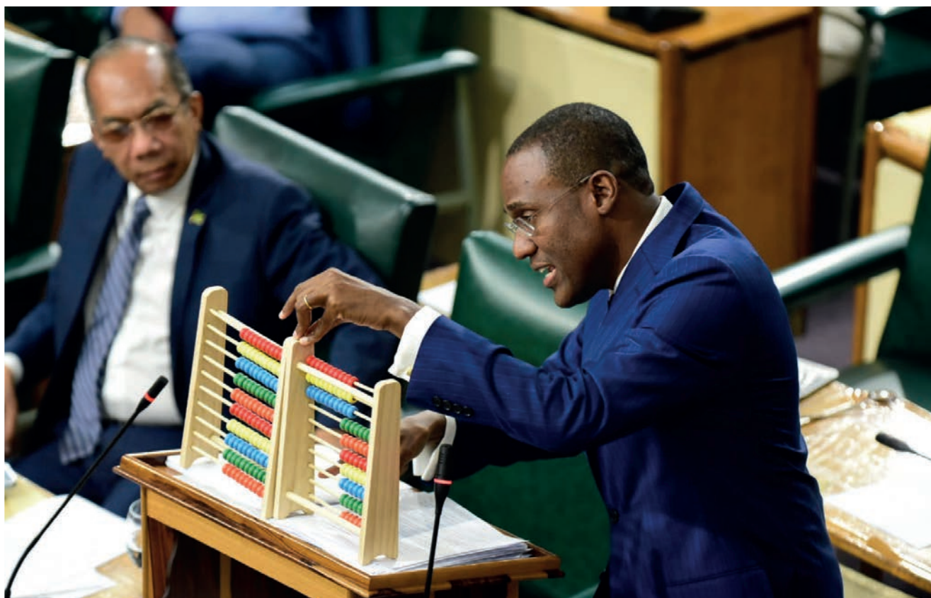
Hon. Nigel Clarke, DPhil., MP, Minister of Finance and the Public Service delivers the 2023 Opening Budget Presentation in the House of Representatives on Tuesday, March 7, 2023.

Hon. Nigel Clarke, DPhil., MP, Minister of Finance and the Public Service delivered the 2023/2024 National Budget in the House of Representatives on Tuesday, March 7, 2023, to outline how the Government of Jamaica plans to spend its historic trillion-dollar budget in the upcoming fiscal year.