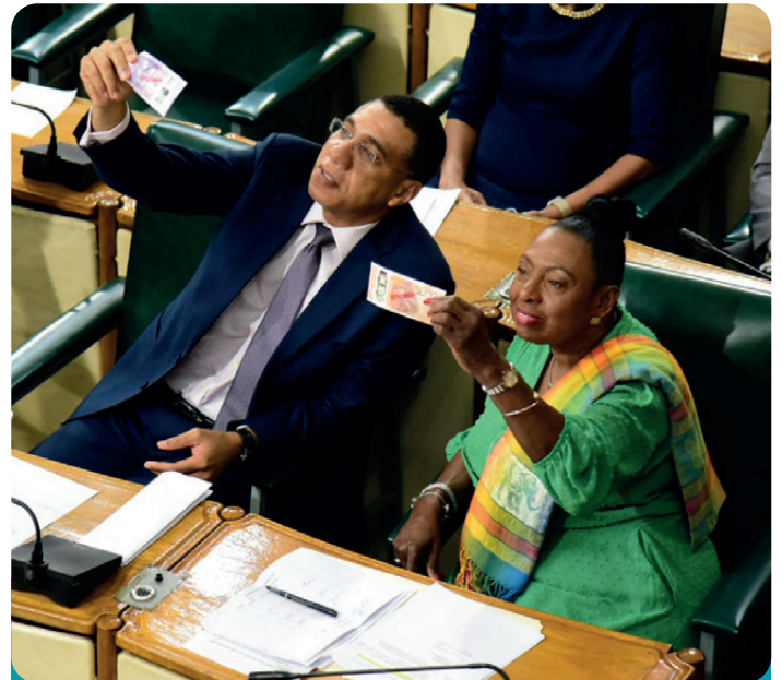
Hon. Andrew Holness, ON, PC, MP, Prime Minister of Jamaica and Hon. Olivia 'Babsy' Grange, CD, MP, Minister of Culture, Gender, Entertainment and Sport scrutinise the upgraded banknotes.