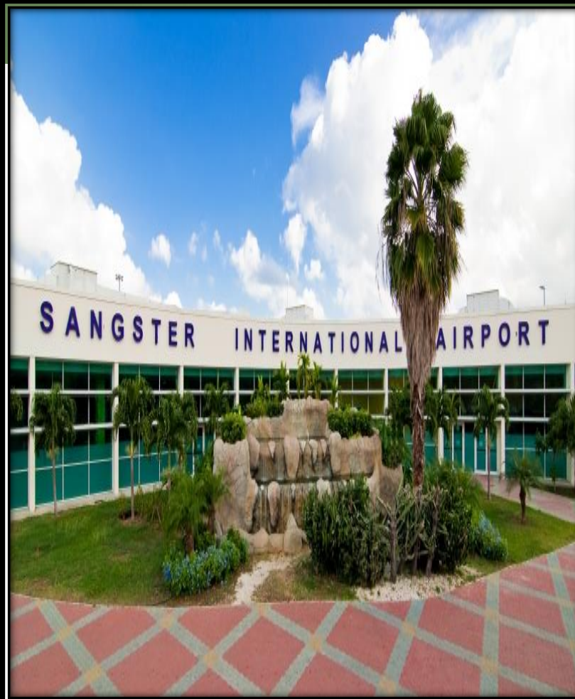
Sangster's International Airport